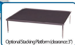
Optional Stacking Platform (clearance: 3")