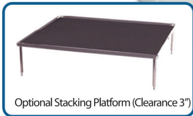
Optional Stacking Platform (Clearance 3")

The Orbi-Blotter™ features a gentle orbital motion with speed control down to as little as 3 rpm, making it the ideal orbital choice for low speed applications, such as blotting, washing, staining/destaining, etc. A large 14x12 in. work surface is included along with a non-slip rubber mat for holding trays, dishes, plates and other flat vessels.