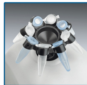
Unique Multi-Head allows for standard vortexing, PLUS holds up to 8 microtubes